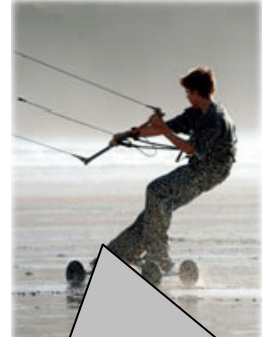
Image placed here Align to top of text and align to right margin 1 mark with text wrapped 1 mark Resized to 5 cm high x 3.3 cm wide 1 mark

A four line kite is needed for power kiting, where the kite is connected to a handle or bar, and, by pulling on the power lines, the kite will take off and rise. Pulling the brake lines causes the kite to land.